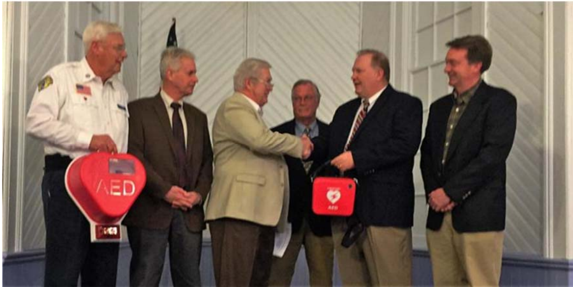
Presentation of AED To Gwynn's Island Civic League, Thursday, March 4th, 2016

HRUHCA won the AED in a raffle drawing at the Mathews Volunteer Rescue Squad's 3rd Annual Super "Bowl" Chili Cook-Off at the Piankatank Ruritan Club.